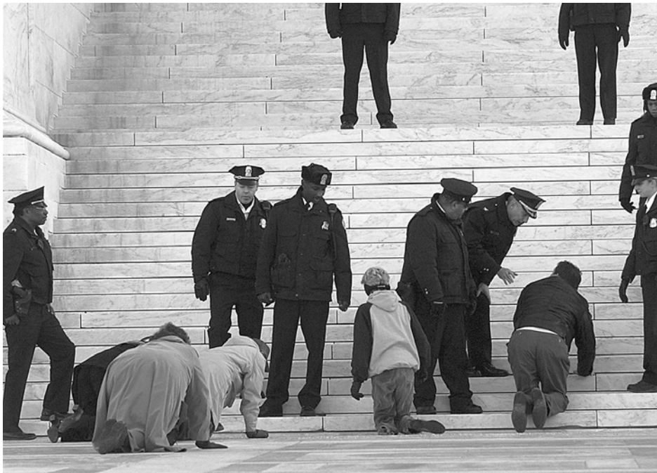
Figure 4. 33

The question for the twenty-first century is what to do with all those now eligible to come to court to try to enforce rights. The answers I have discussed so far are insufficient, for they help a tiny subset of civil litigants. What is needed instead is a broader conception of constitutional obligations founded on deepening the meaning of equality and recognizing the positive relationship between government and its citizenry. Insights into how to fashion its contours come from one last example of Justice Ginsburg's opinions, again involving courthouse barriers—in this instance, physical barriers. This image captures the problem. (See Figure 4.) The picture shows protesters at the Supreme Court who were demonstrating the challenges that courthouse steps pose for those who have difficulty walking.