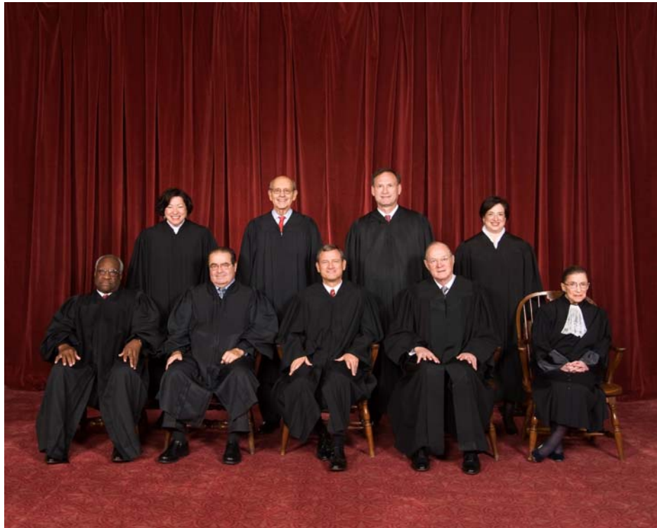
Figure 3. 6

Look then at the next image—a 2010 picture of the current Supreme Court with its nine Justices, including our honoree, the inaugural Gruber Lecturer, Ruth Bader Ginsburg. (See Figure 3.) This picture underscores a second point, which is the importance of appreciating the remarkable change that has taken place in the last seventy-five years, during which time courts were reinvented as institutions welcoming all of us. Today, every person—regardless of gender, race, and ethnicity—is authorized to play all roles—from litigant and lawyer to witness and juror to Supreme Court Justice. This idea is both relatively new and deeply radical when held against that 1938 baseline—when a “mulatto” Justice had to be shrouded in drapes because neither state nor federal officials wanted a dark-skinned woman to adorn a courthouse wall.