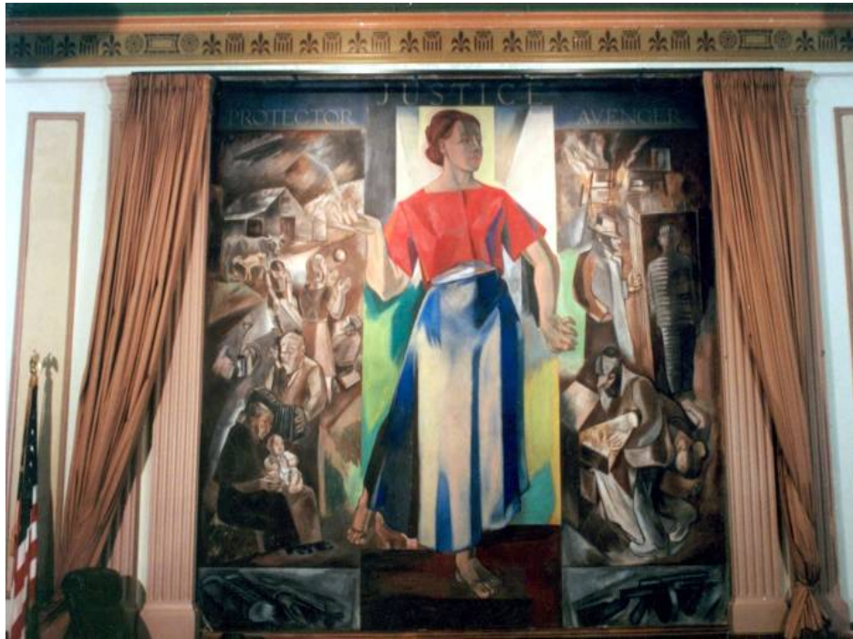
Figure 1. 2

What did others see? A local newspaper objected to this “barefooted mulatto woman wearing bright-hued clothing.” The federal judge in whose courtroom the mural appeared termed it a “monstrosity”—a “profanation of the otherwise perfection” of the courthouse.