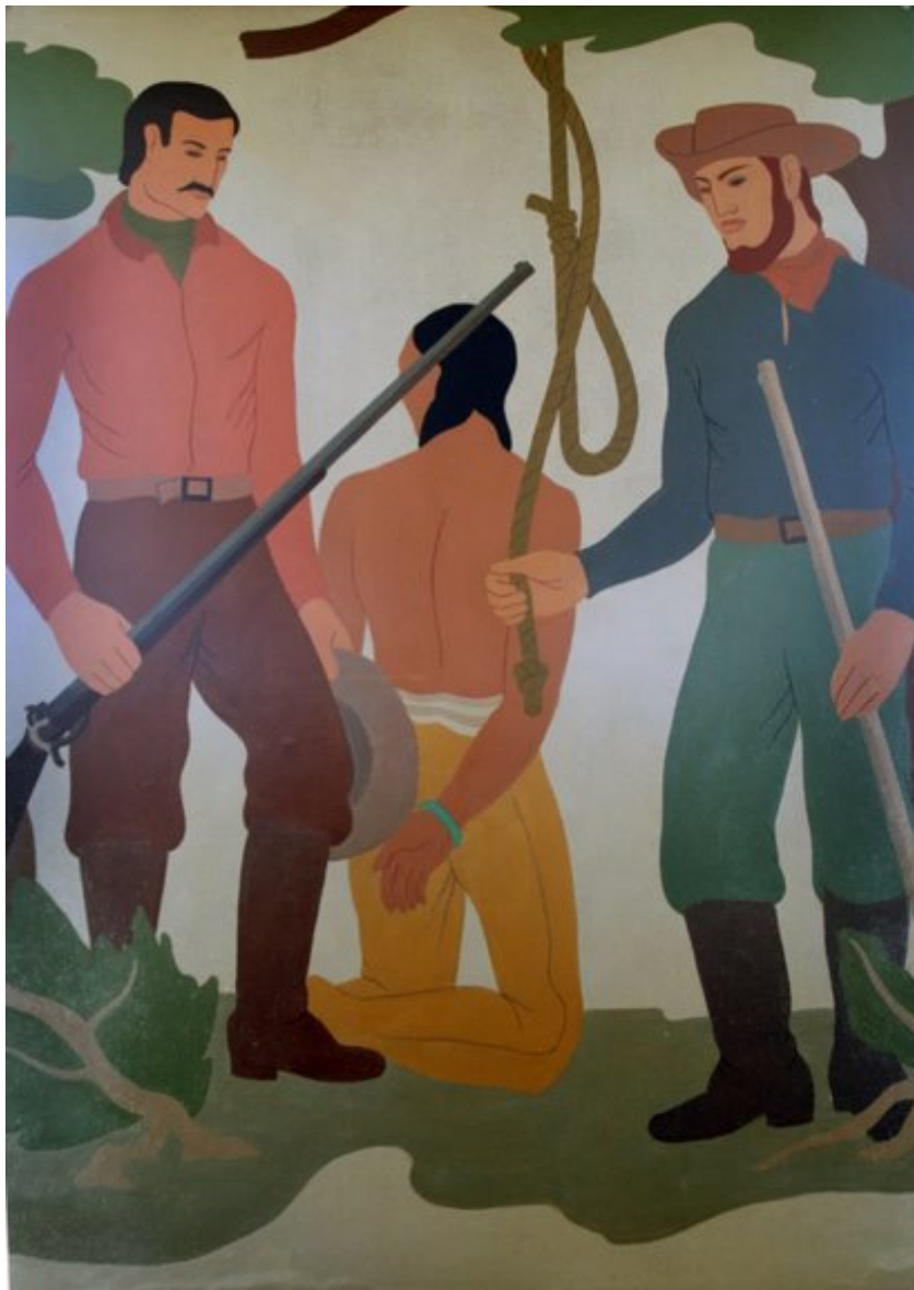
Figure 2. 5